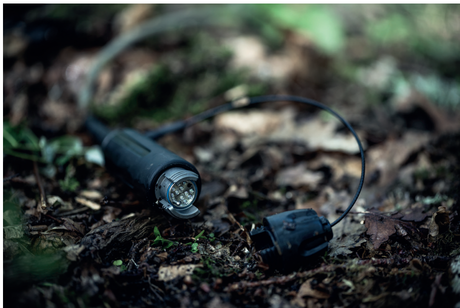
FALCON™ - The smallest expanded beam connector on the market.

developed for the FALCON connector, launched in 2013. It is used by the SAF in all applications where rugged components are a requirement. FALCON is the smallest 12 channel expanded beam connector on the market that fulfill the beam diameter specified in MIL-DTL-83526. Tested to meet the world's toughest specifications and with very low insertion and return loss.