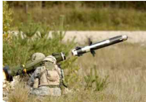
Javelin 85.000 $