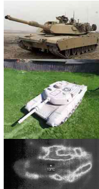
real 6.000.000 $